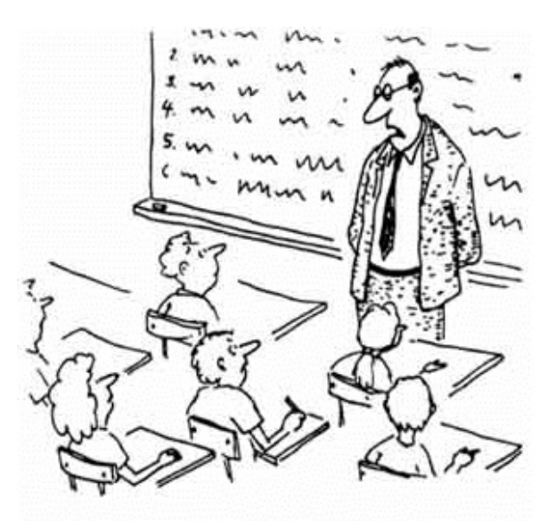
"I expect you all to be independent, innovative, critical thinkers who will do exactly as I say!"